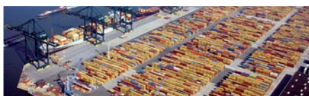
SUSTAINABLE SHIPPING LNG – fuelling debate