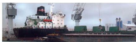
TRENDS IN THE BULK SUPPLY CHAIN A terminal operator perspective